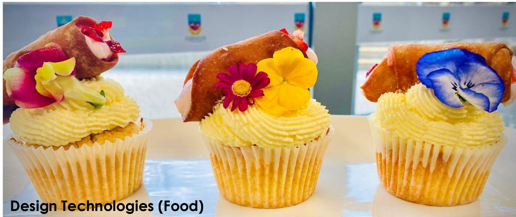
Design Technologies (Food)